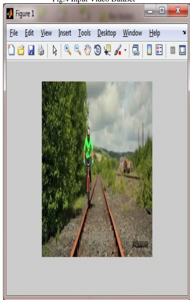
Fig. 5 Selected Input Video