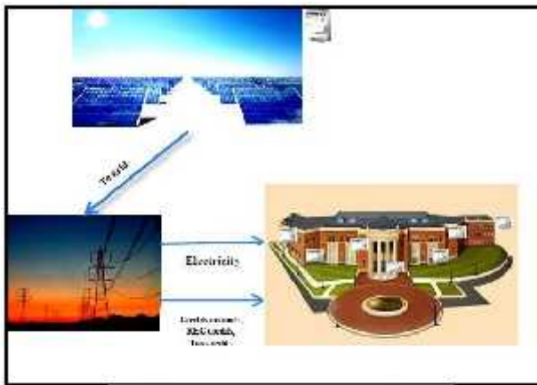
Fig. 2.2 Aggregate Net Energy Metering system

II. Aggregate Net Energy Metering- It tends to have a single purchaser with a single generation system and uses multiple meters underneath the same roof to offset power from multiple meters. Eventually, accumulating all the benefits under a single purchaser. In the figure below, we can see that a single onsite generation of solar panels supplies electricity to a large area . The excess electricity is sent to the grid and this is recorded by multiple net meters under the same Area , for which credits on electricity is achieved by the participant. This flow is clearly displayed in the below given figure.